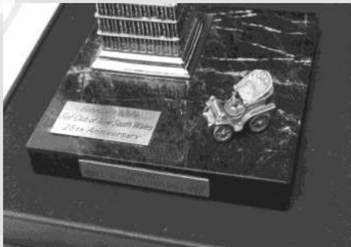
"Mole Antonelliana" model given to the club by Fiat for our 25th Anniversary.