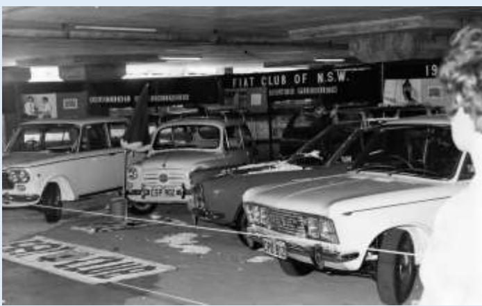
1969 Car Club Show, Roselands