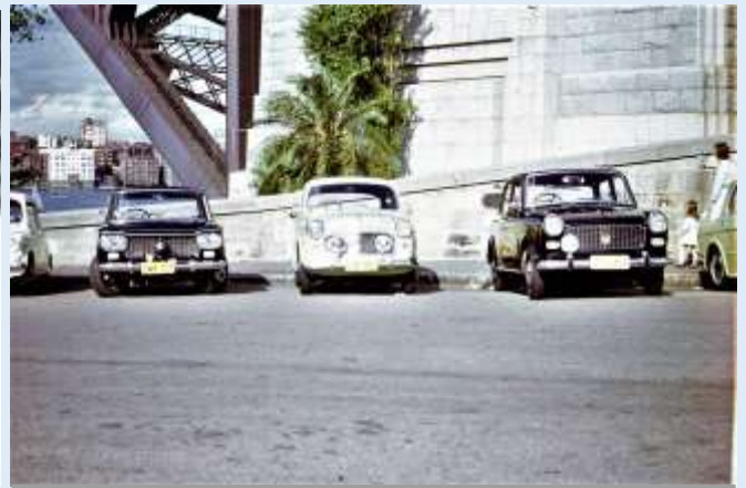
1965 Concorso - Harbour Bridge