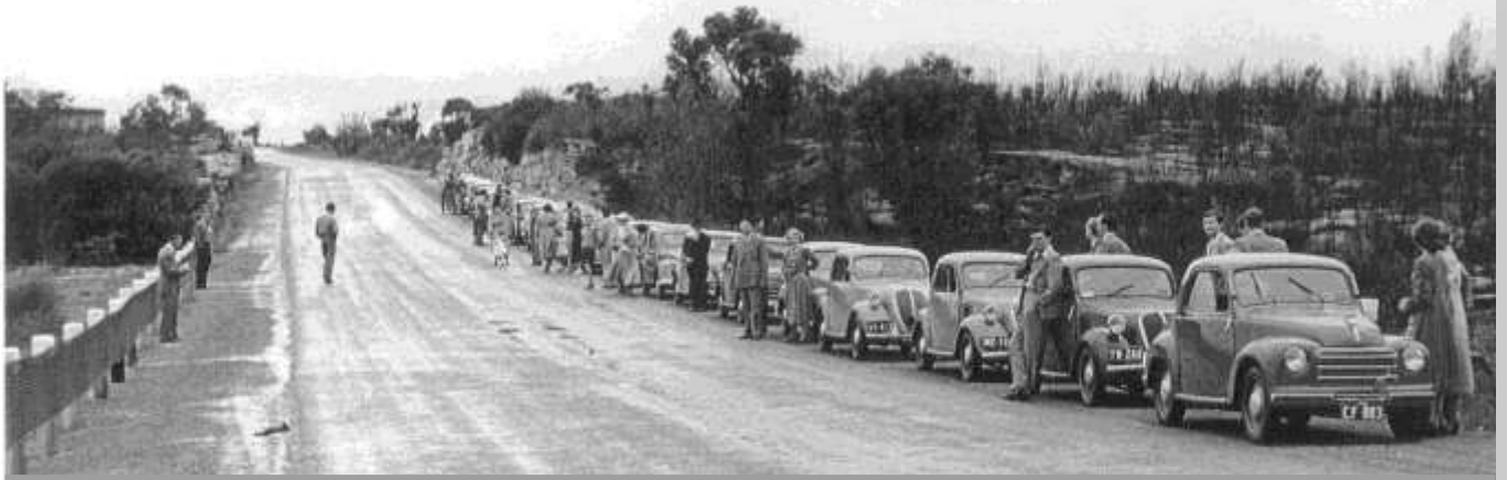
An early outing of the Fiat 500 Club of NSW with a line-up of 20 Fiat 500's. George is on the extreme left.

The early members used to acknowledge each other in city and country driving by giving two quick toots on the horn as a recognition signal.