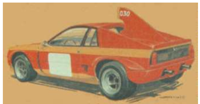
Mid engine Abarth 030 with Fiat V6 engine

The 031 did manage to race and seemingly do well (looking at it I would have been very disappointed if it did not produce good results). On the next page are some of the specifications for this model. You can find more information on the internet.