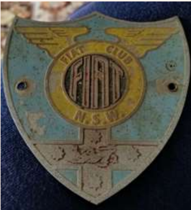
The Badge that Ian bought