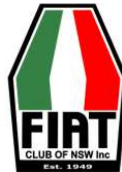
2011 - present