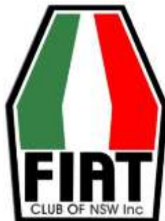
Incorporation Badge 1997