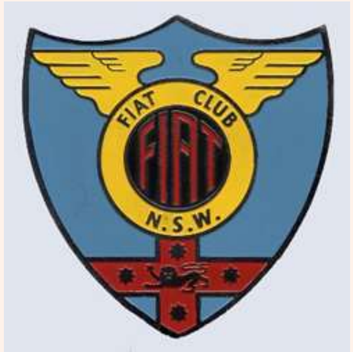
What the badge should look like