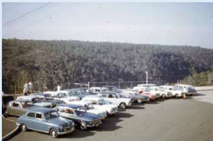
Warragamba Dam picnic, 1965.