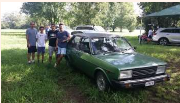
The Polito family were out in force for the Motorkhana and the junior clinic.