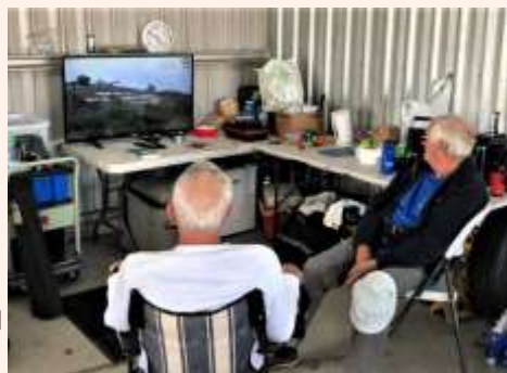
The 'other' big race was at Bathurst

garage is a through the pit crew holding a board to show you your previous times or when it is time to pit. The pit wall crew is made up of one person with the stopwatch and another operating the board. Aside from the support crew, the drivers would perform tasks at the pit wall when not driving.