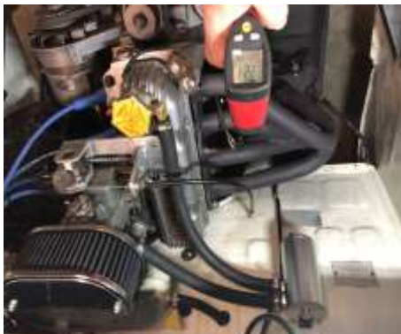
Checking the Header temperature

150 degrees cooler than the other 3 cylinders. The affected cylinder did not change when I swapped the spark plug leads so I started looking further upstream for the cause.