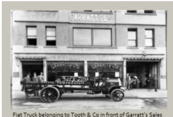
Fiat Truck belonging to Tooth & Co in front of Garratt's Sales and Service, Elizabeth street Sydney, 1914

The last event for the year was to be held at the North Rocks Cricket Ground and that the organizers wanted to make this the biggest club event so far (how many more Fiats could they expect to find in Sydney?). Instructions were to meet on Sunday December 6 at the Vauxhall Inn, Parramatta (Cnr of Parramatta Rd and Woodville Rd) at "11 o'clock" and proceed to the grounds for an afternoon of fun including novelty driving tests, musical chairs, peg driving and potato races (I am guessing potato sack races as potatoes are not noted for their speed, or any movement under their own power at all).