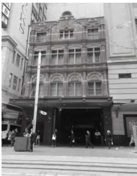
The site in George Street where the Bateman's Hotel existed. Here, the first meeting of the NSW Fiat Club was conducted