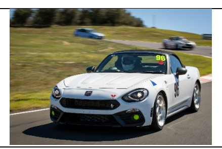
#5. In 2019 this 2017 Abarth 124 Spider came up for grabs in a written off vehicle auction in Canberra. The damage done to it you can just see in this picture, but of course the airbags and seat belt pretensioners had also gone off, which is why the insurance company wrote it off.