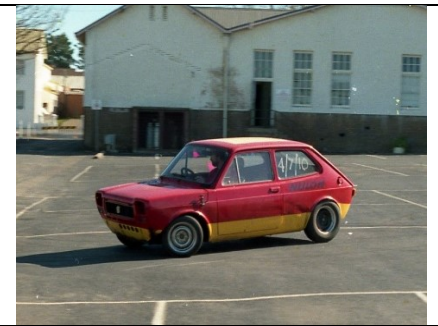
The first two photos are at the Fiat of Italy Cup, the first at Dubbo in 1990 and the second in 1988 at Orange. Wayne McGeorge won 1<sup>st</sup> Outright in the 127 in the 1985 Fiat of Italy Cup when it was held at Forbes.