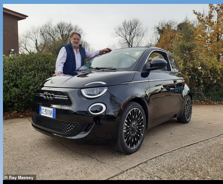
The 500 is one of only two electric-powered cabriolets currently on the market, sitting alongside the even dinkier Smart EQ ForTwo Cabrio

There are two main models at launch – hatchback and cabriolet - and a third called a