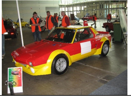
Glenn did most of the mechanical work and I did all the painting and bespoke stick-on lettering. Its first public viewing was at a car show at Darling Harbour in June 2007 (above), but we had to push it in and out of the place because the engine was not yet operational.