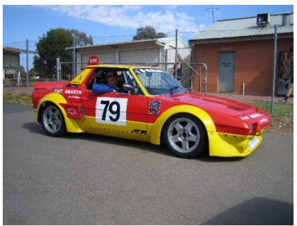
The car's first track outing was a Hillclimb at Bathurst in the 2008 Fiat Nationals. We were amazed that it finished the day with only a minor electrical gremlin. It did quite a lot of track km's after that at Fiat Nats in 3 states and long distance 6 Hour, 8 Hour and 12 Hour relay races. We sold it in 2019 to move on to other projects.