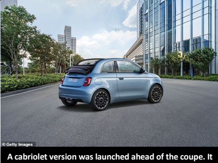
will not be sold with a petrol or diesel engine.

Built on a new platform specifically to be electric, all of them are larger than the outgoing Fiat 500 – around 60mm longer, 50mm wider and with a broader wheelbase, bigger wheels up to 17 inches and a roomier interior.