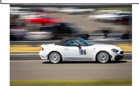
But for a track car we didn't care about any of that, so with only 7,500 km on the clock, it was straight onto the track with a modern, reliable car (with air con!). Glenn has had a roll cage fitted, built himself a new exhaust system, had the engine professionally tuned and upgraded the brakes.