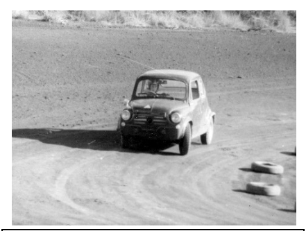
I think we also did a few lap dashes and the above shot was taken at Amaroo Dirt. The first time we turned up with it at a Thornleigh Club 'khana there seemed to be a lot of mirth, but at the end of the day they were no longer laughing. I'm pretty sure that I won their novelty event. I can't remember what happened to it though.