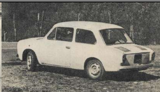
1962: 2-door, 4-cyl, 1000cc (note the 1100 style tail lights)