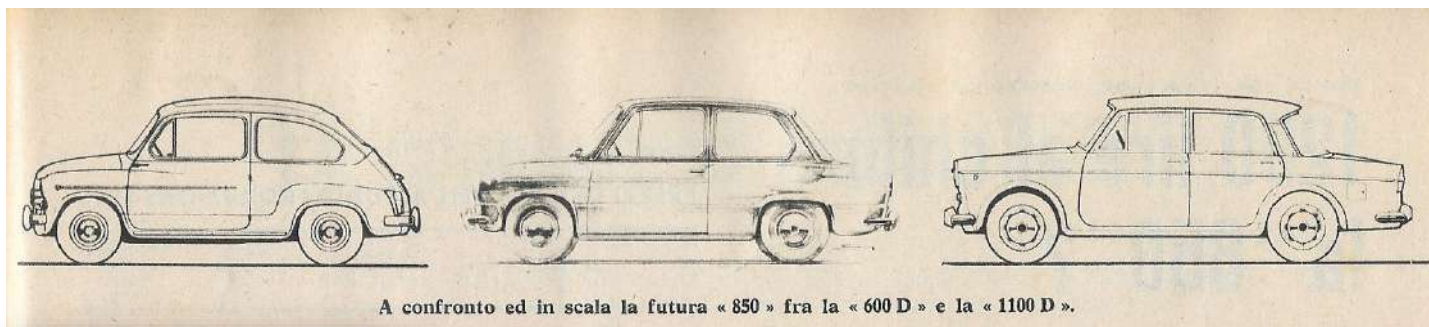
A confronto ed in scala la futura « 850 » fra la « 600 D » e la « 1100 D ».