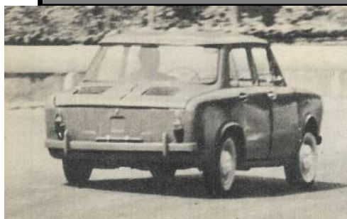
1961: 4-door, 4-cyl, 1000cc