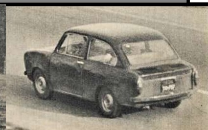
Above and below; 1962-63, the size and the shape of the 2-door car resembles the final product (but still with 1100 type tail lights). Engine is now 4 cyl, 850 cc.

Postscript - The FIAT 850 was the last to be named after the engine capacity of the model before the model or project number became the standard of nomenclature from 1964 onwards beginning with the 124 then the 125, 128, 127 and so on. These model numbers had always been applied to FIAT cars with the following official number designations applied to the following FIAT passenger cars; model 100 is the FIAT 600, 101 - FIAT 1400 (1400 diesel is the 1400N), 102- a prototype to replace the Topolino but never produced, 103 - the 1100, 104 - 8V, 105 - 1900, 110 - Nuova 500 (Bianchina is the 110B), 112 - 1800, 114 - 2100 (the 2300 being the 114B), 115 - 1500, 116 - 1300, 118 - FIAT 1500S & 1600S Spiders, 120 - 500D Giardiniera, 122 - the FIAT 850. (source-Quattroruote, Feb-1964)