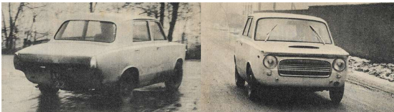
1960: Chevrolet Covair styled 4-door sedan, 3 cylinder 850 cc engine mounted at the rear. The following year, the plan was updated to include a 4 cylinder engine with an increase in capacity of the engine to about 1000, similar to the French built Simca 1000 (Simca being the French subsidiary company of FIAT).

1959 (above): FIAT envisages a small sedan to sit between the 600 and 1100 models. Initially a 4-door, rear-engined car of up to 1000cc (4 cylinder, 920cc) was considered (model # 122).