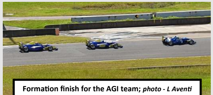
Formation finish for the AGI team