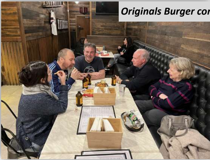
Originals Burger company,