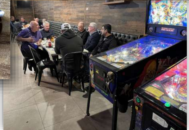
Benzin Café, Dural