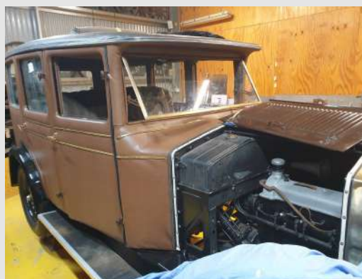
The FIAT in 2022 showing the right and left hand sides of the leather body