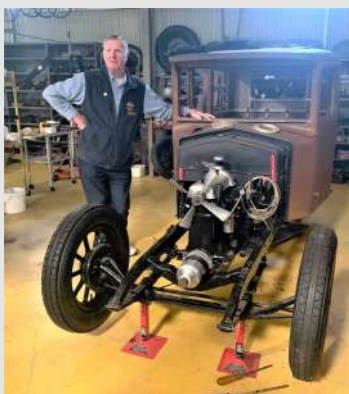
The FIAT in 2019