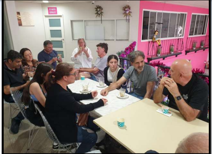
A good roll up of members and their families, one travelling from Wollongong, took

advantage of a hot Saturday afternoon to venture out and try some freshly made gelato at Art of Gelato in Carramar.