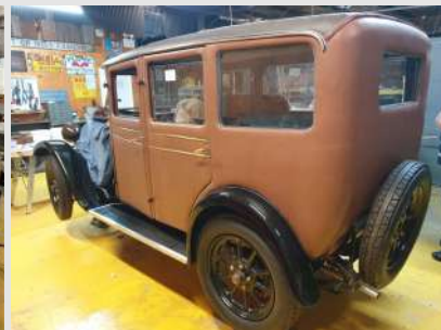
The FIAT in 2022