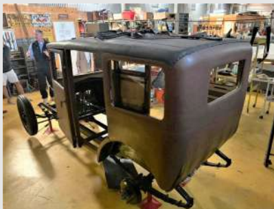
The FIAT in 2019

Late last year I visited the museum and was shown the progress made on the FIAT since the last visit by the club. The car now has much of the drive train and electrics in place, floor boards, windows and interior fitted and the most of the bodywork has been done. While there is still a bit to do to complete the car, you will be able to see from the photos how far the eager workers at the museum have come over the past 3 years.