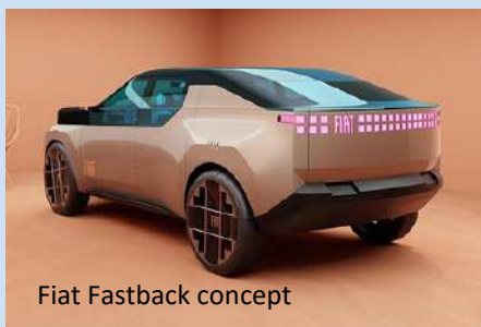
Fiat Fastback concept

Like the future Panda, designers have applied blocky retro styling to the small lifestyle-oriented dual-cab.