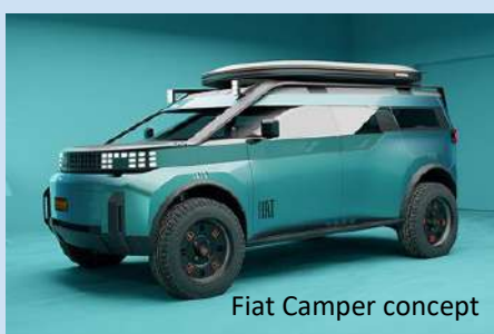
Fiat Camper concept

What could be relevant for our market is Fiat's declaration that it wants to replicate the success of the Strada in Latin America globally, including Europe – a less-than-subtle hint the next-gen ute will be rolled out to new markets that could