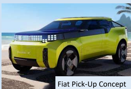
Fiat Pick-Up Concept

The Fiat Pick-Up concept, meanwhile, is the best indication yet on how the brand plans to replace its Strada ute, which remains the best-selling car in Brazil.