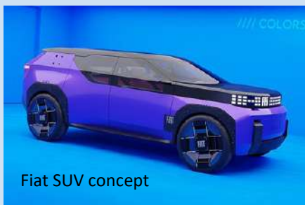
Fiat SUV concept

throughout to lower its environmental impact.