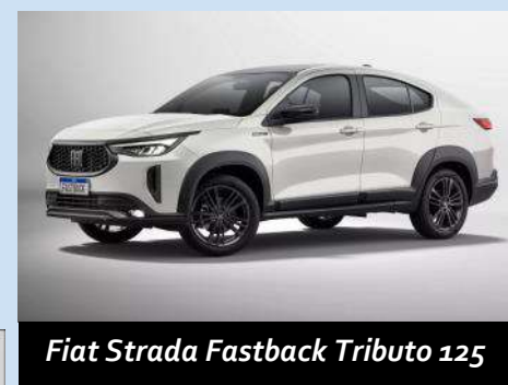
Fiat Strada Fastback Tributo 125

leather, with bronze inserts/accents and the Fiat flag finished in gold. Standard equipment is quite generous in all Tributo 125 special editions, including digital A/C and infotainment touchscreens (mostly the 10.1-inch unit).