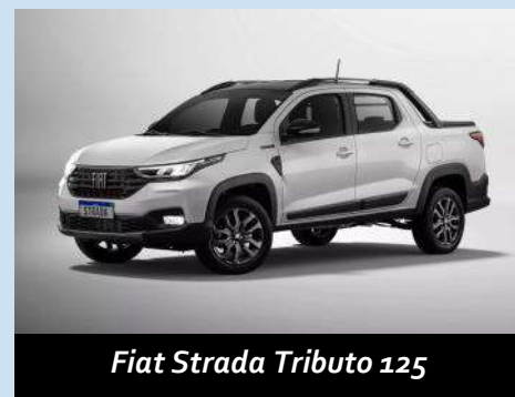
Fiat Strada Tributo 125

The Tributo 125 models are already available to order in Brazil. Prices start from R$93,990 ($17,283) for the Argo small hatchback, R$128,990 ($23,719) for the Pulse subcompact SUV, R$133,990 ($24,639) for the Fastback coupe-SUV, R$134,490 ($24,731) for the Strada pickup, and R$184,490 ($33,925) for the Toro pickup.