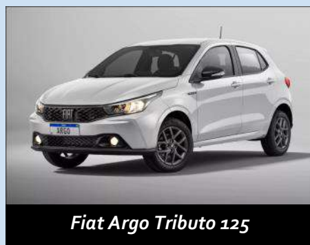
Fiat Argo Tributo 125

Fiat introduced "Tributo 125" editions of its entire model range in Brazil, as part of the celebrations for brand's 125th birthday in 2024. The models are based on the best-selling versions of the Argo hatchback, Pulse subcompact SUV, Fastback coupe-SUV, Strada and Toro pickups, enhanced with a special content package, new colors, and Tributo 125 emblems.