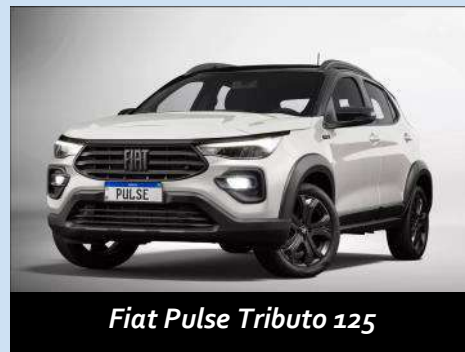
Fiat Pulse Tributo 125

leather, with bronze inserts/accents and the Fiat flag finished in gold. Standard equipment is quite generous in all Tributo 125 special editions, including digital A/C and infotainment touchscreens (mostly the 10.1-inch unit).